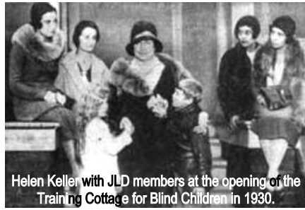
Helen Keller with JLD members at the opening of the Training Cottage for Blind Children in 1930.

The Junior League of Detroit is a dynamic group of women leaders who have been making change happen since 1914. For over 100 years we have been striving to